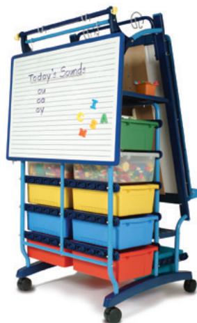
Premium Royal® Inspiration Station (IS3) Back view