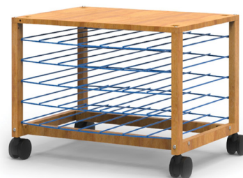
Drying rack only (BPC-DR)