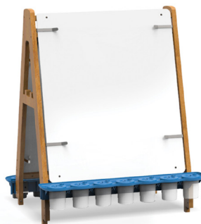
Easel only (BPC02)

© 1986 Panda symbol WWF-World Wide Fund For Nature (also known as World Wildlife Fund). ® "WWF" is a WWF Registered Trademark