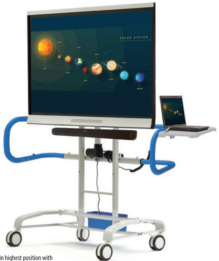
Premium model shown in highest position with optional sound bar mount (sold separately IFP-ACS2)

70" Maximum height based on a standard 65" Interactive Flat Panel