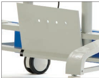
Laptop tray stores away when not in use or when on the move

70" Maximum height based on a standard 65" Interactive Flat Panel