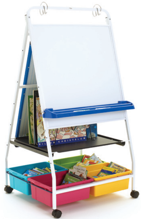
NEW Classic Royal Reading Writing Center with vibrant color combo (RC005-VM)

Lifetime on easel components 5 year on whiteboards