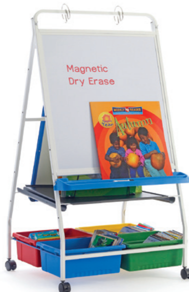
Classic Royal Reading Writing Center with classic color combo (RC005)