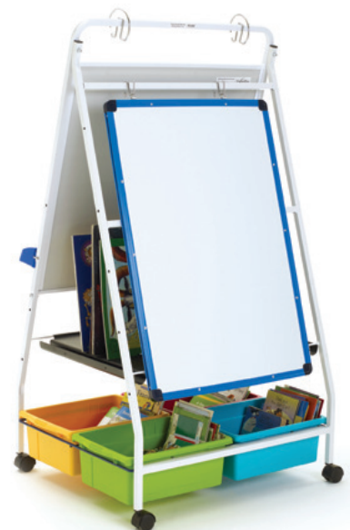
Rear removable double-sided dry erase board (lined on one side)

For further details, please visit our website or contact Customer Service. www.copernicused.com 1 800 267 8494