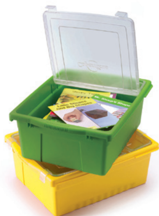
Both models are available with four see-through hinged lids (RC005-L & RC005-VM-L)