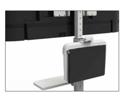
Back view with laptop tray stowed (IFP600)