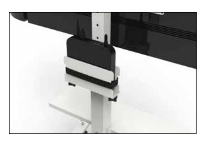
Mini PC Mount (IFP650)