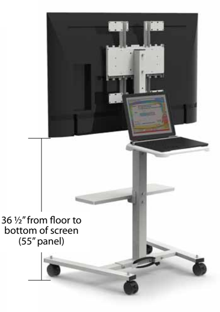
Back view with laptop tray in use